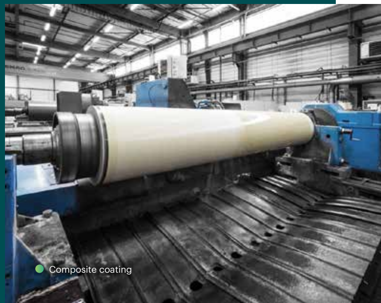
● Composite coating