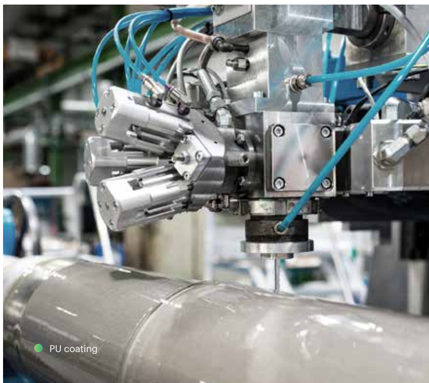
● PU coating

Thanks to our state-of-the-art machinery, we can produce polyurethane coatings with the very best properties.