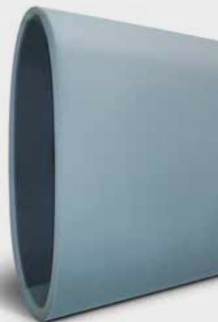
● Sanforizing rubber shrinking belts