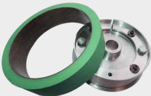
● HandySleeve® + HandyBase

Hannecard developed HandyCoat®, a revolutionary coating system for beverage cans, to meet the needs, requirements and increased production of the beverage can industry. Our unique system provides a quick and efficient method to apply coatings to aluminum cans, imparting significant time and cost savings.