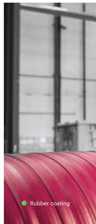
● Rubber coating