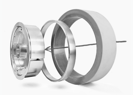
Mount the spacer on the HandyBase