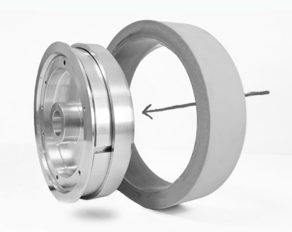
Mount the Handy-Sleeve to cover the remaining area