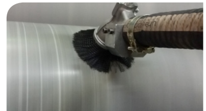
Surface regeneration is needed in order to get back an appropriate surface roughness