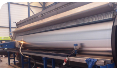
Grinding repairs problems with both surface and shape. It improves drying capacity, reduces breaks of the paper web, improves CD profile, extends the lifetime of felt and eases doctoring. (up to 0,15 mm/Ø)