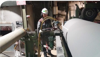
Tungsten carbide coatings with adjustable surface roughness