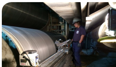
Surface machining is applied in case of strong surface profile deviation or big impact. (up to 1 mm/Ø)