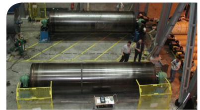
Balancing can be performed on site without removing the parts or at the customer's premises after removing them. This saves a great deal of time and costs that would otherwise have been incurred from downtime.